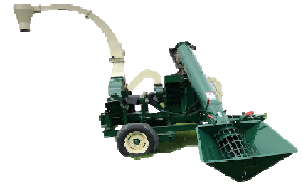
26" Hammermill-Blower + Feeder