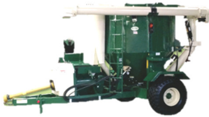
6140 Mixer + Auger Feeder

Ellis Equipment is your Art's-Way sales rep, not a distributor. Dealers will be invoiced by Art's-Way