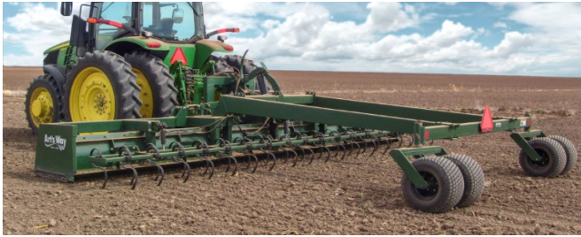
V2400 Land Plane + Dual Wheels + S-Tines

Ellis Equipment is your Art's-Way sales rep, not a distributor. Dealers will be invoiced by Art's-Way