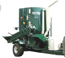
6530 Mixer + Auger Feeder