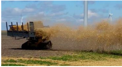
864 Top Spread

Ellis Equipment is your Art's-Way sales rep, not a distributor. Dealers will be invoiced by Art's-Way