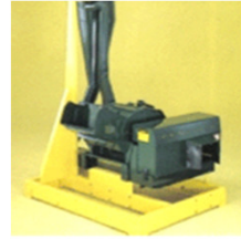
26" Hammer Mill