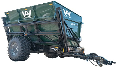
9016 HD High Dump Cart

Ellis Equipment is your Art's-Way sales rep, not a distributor. Dealers will be invoiced by Art's-Way