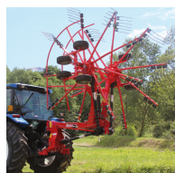
DUO/610 3-Pt 20' Twin Rake