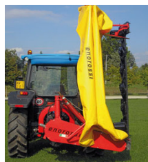
DM Disc Mowers