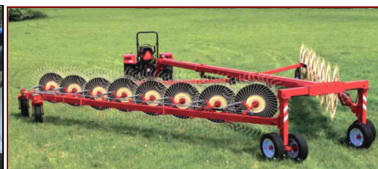
Easy-Rake ER/16 + Poly Slides

The only wheel rakes with 60" Jumbo wheels on all models.