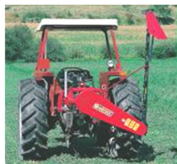
BFS Sickle Mower