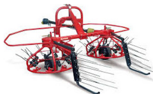
TOP/300 Combo Rake/Tedder