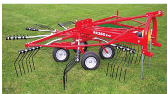
RR320-9 Rotary Rake