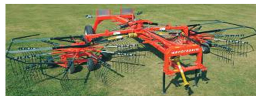
DUO/780 25'6" Trailed Twin Rake