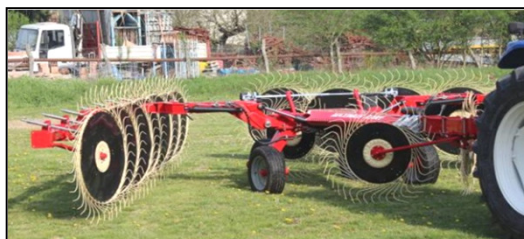
Maximus Rake + Poly Slides + Kicker