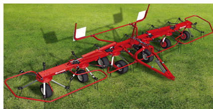
G6V/24PT Hay Tedder