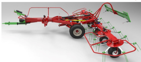
G6V/24TTP Carted Hay Tedder