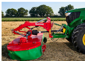
STORM/300 Front Disc Mower